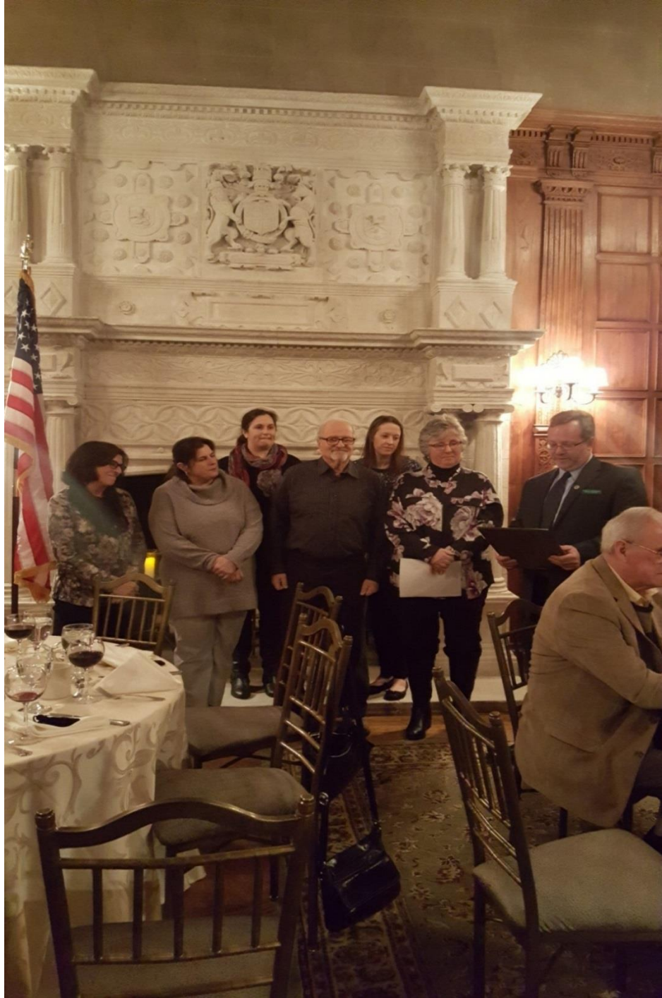
Ringwood BOH Members receive recognition at the 100 th Anniversary celebration and Annual BOH Meeting held on February 13, 2019 at the Skylands Manor.